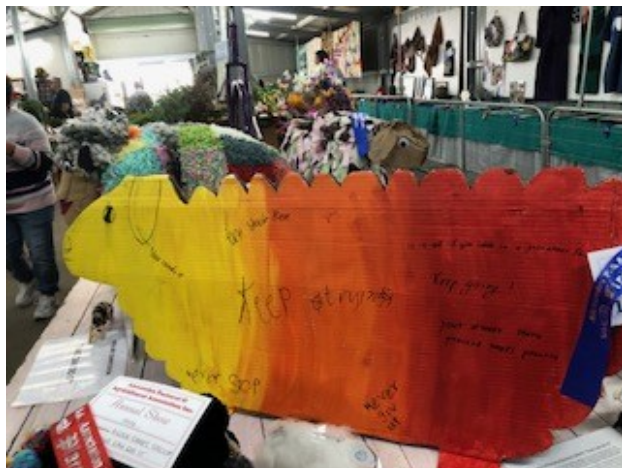
2024 Group Winner