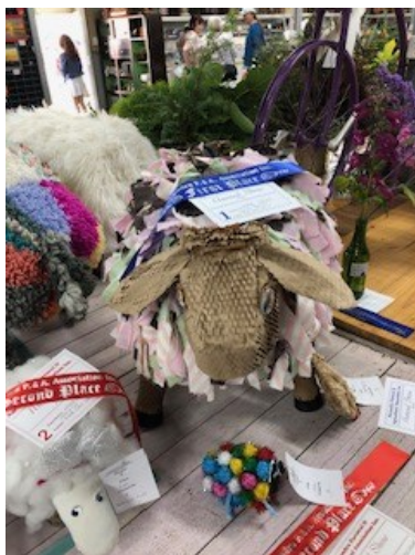
2024 Individual Winner

In its fifth year this competition is an opportunity to celebrate sheep and the creativity of local artists. Open to all ages and all types of art and craft including upcycling and the use of reusable materials. Group and individual entries Encouraged No size restrictions All entries must be portable and able to be carried by one person.