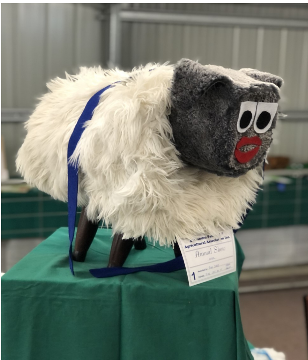
2022 Group Winner

All entries must be portable and able to be carried by one person.