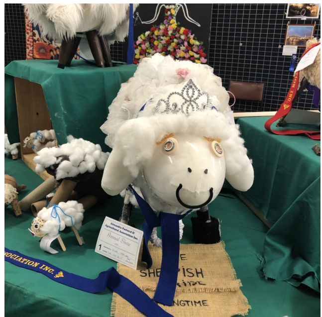
2022 Individual Winner